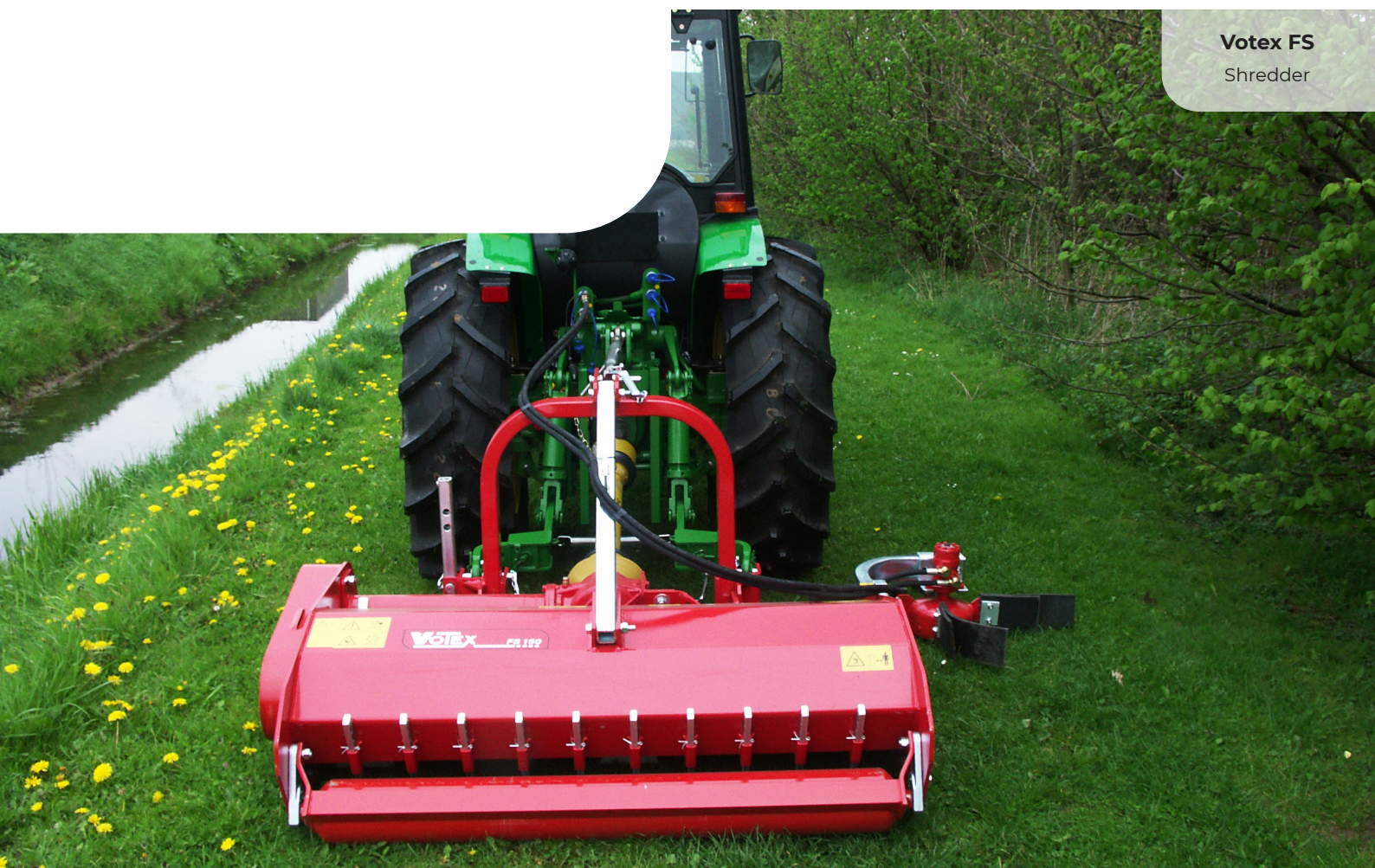
Votex FS Shredder