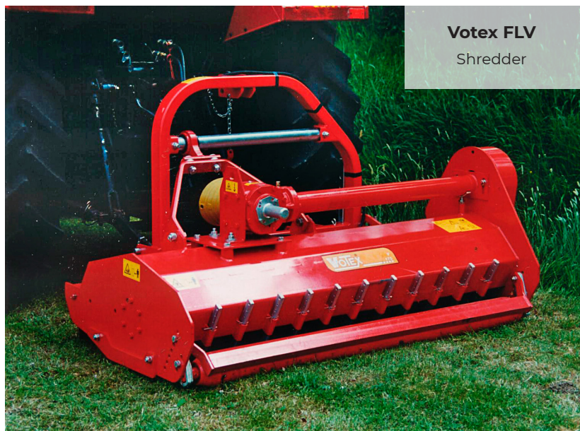
Votex FLV Shredder